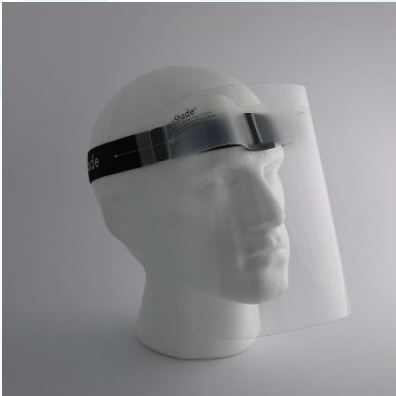
Samples described as Virashade M